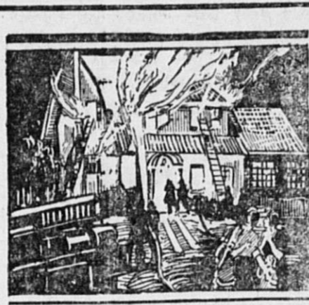
Are You Protected?