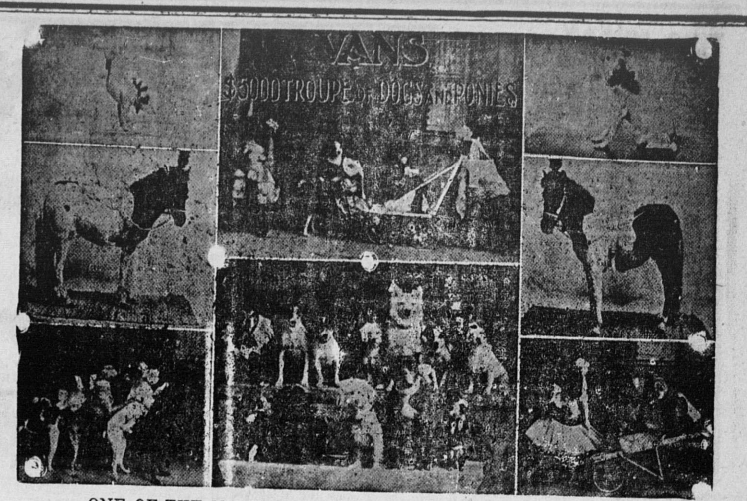
ONE OF THE MANY FREE ACTS AT THE IOSCO COUNTY FAIR