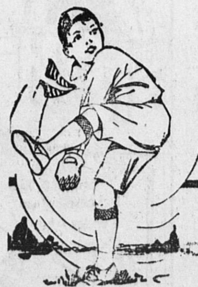
ROBIN HOOD School Shoes

Ladies' Silk Dresses ALL SILK DRESSES that were formerly $11.75, for balance of August, reduced to..... $8.98