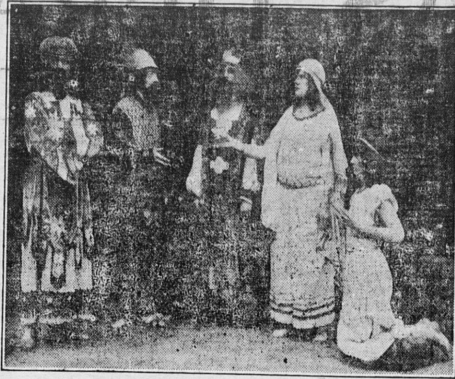
Scene From "The House of Rimmon"

Through special arrangements with the author, Dr. Henry VanDyke, and his publishers, Charles Scribner's Sons of New York, there will be presented on the second day of the Chautauqua "The House of Rimmon," a four act drama, the action of which takes place about 800 B. C. in Damascus, the world's oldest city, which was at that time the seat of government of the Kingdom of Syria. In addition to the distinct literary value of the piece which is to be expected of a drama from the pen of a world famous author such as Henry VanDyke, the play has a strong, popular appeal. It is a story of intrigue, with a fascinating plot, the unfolding of which holds the audience enthralled. The producers have used extreme care in costuming the production authentically and never before in Chautauqua have costumes as expensive and as beautiful been used.