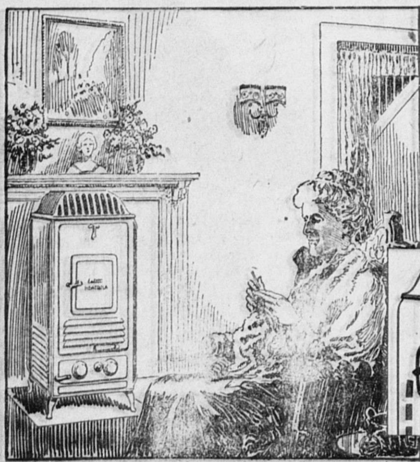
The Intensi-Fire, built into the Heatrola directly in the path of the flame, makes possible a double air-circulating system. Yet you don't use an ounce more of fuel!

Only the Intensi-Fire can give such Comfort!—only the Heatrola has the Intensi-Fire