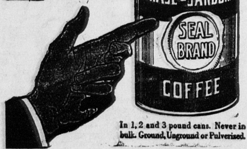
In 1, 2 and 3 pound cans. Never in bulk. Ground, Unground or Pulverized.