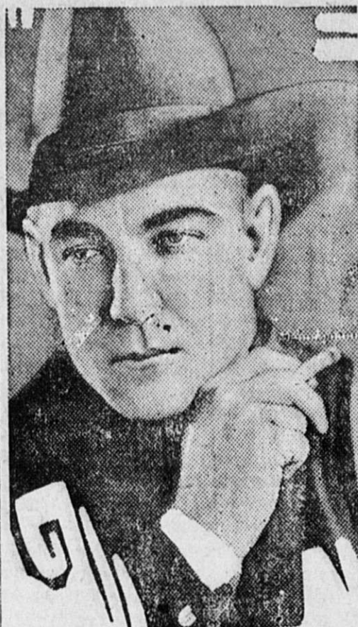
This prominent "movie" star, better known for his splendid horsemanship, was born in Indiana. He is not quite six feet in height, and weighs 175 pounds. He has brown hair and blue eyes. He is among the best known of the Western stars. He was a cowboy before his screen debut made him famous.