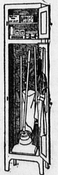
The new Sellers Utility Closets cost less than built-in closets and turn waste space into useful and convenient storage space for dishes, linens, cleaning things, or clothes. Finished in white enamel, walnut or oak.

suit your purse and convenience. Styles to meet any requirement—in white enamel, the new gray enamel and golden oak.