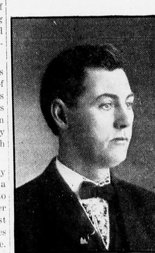
Democratic Nominee for Governor.