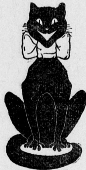
BLACK CAT BRAND CHICAGO-KENOSHA HOSIERY COMPANY KENOSHA, WIS.