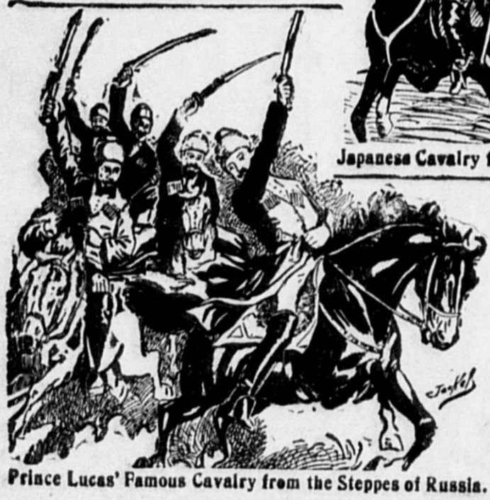
Prince Lucas' Famous Cavalry from the Steppes of Russia.

AQUINALDO'S VETERANS FROM THE PHILIPPINES.