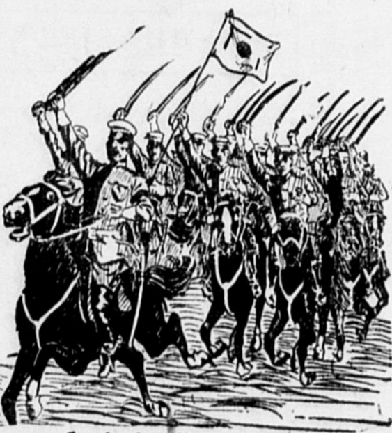
Japanese Cavalry from Yankee Nation of the Orient

Many STRANGE and PECULIAR PEOPLE WEIRD MUSIC FROM THE FAR EASTERN HEMISPHERE.