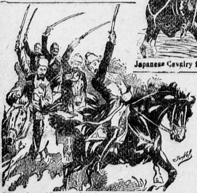
Japanese Cavalry from Yankee Nation of the Orient

Many STRANGE and PECULIAR PEOPLE WEIRD MUSIC FROM THE FAR EASTERN HEMISPHERE.