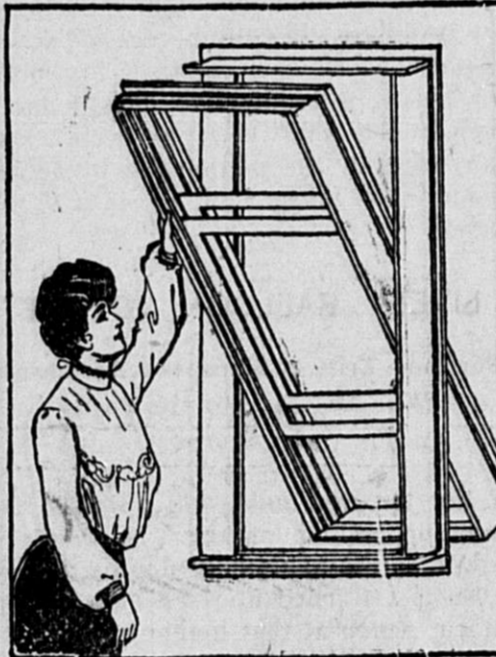
ADJUSTABLE WINDOW SASH.

There is always a certain amount of danger attached to the washing of the outside of the windows, especially in the upper stories, as the narrow width of the window sills allows but scant space on which to sit, and many a housewife, even if she has plenty of nerve, is afraid of slipping. For this