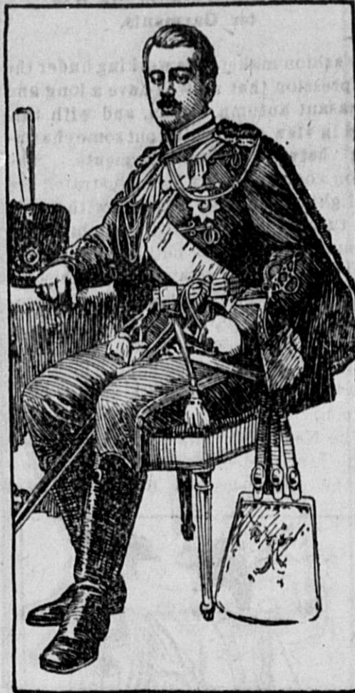
GRAND DUKE BORIS.

Grand Duke Boris, who was reprimanded by General Kuropatkin for his escapades and subsequently recalled from the seat of war by order of the czar, is the second son of Grand Duke Michael, uncle of Nicholas II. of Rus-