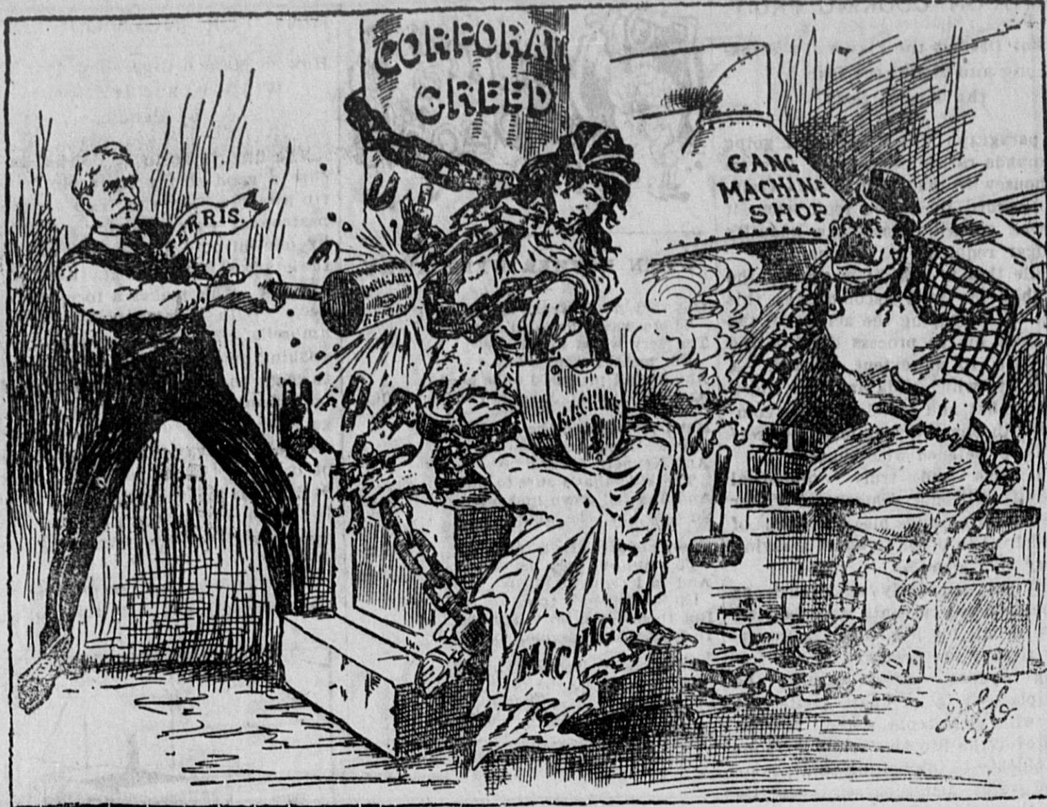
BREAKING THE CHAINS.