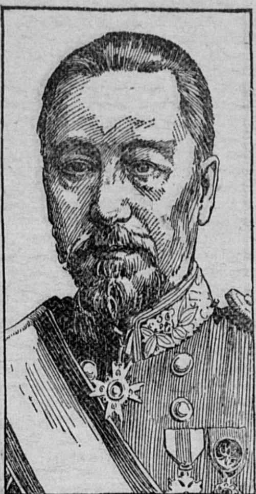
VICE ADMIRAL HEIHACHIRO TOGO.

One of the most interesting figures in the war in the far east is Vice Admiral Heihachiro Togo, commander in chief of the Japanese war fleets. Admiral Togo attracted the attention of the whole world by the daring of his attack upon the Russian fleet at Port