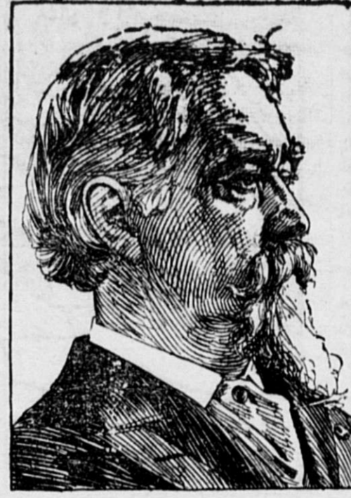
GENERAL JOHN C. BLACK.

General John C. Black, the newly elected commander in chief of the Grand Army of the Republic, entered the army during the war of the rebellion as a private and left it a brevet brigadier general. He was born in