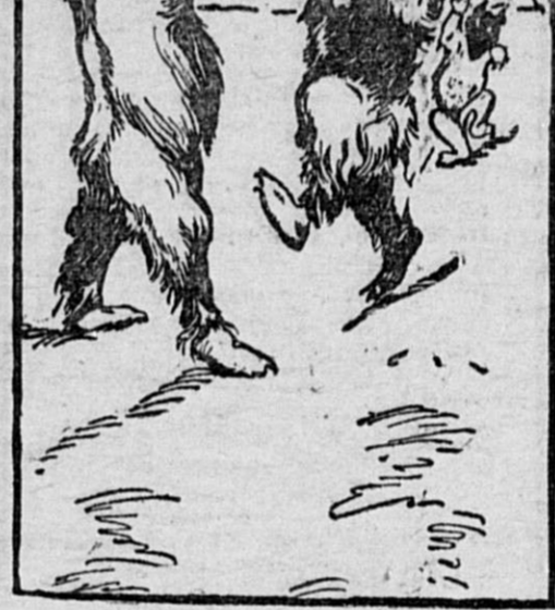
FLYING AROUND LIGHT FOOTED AND LIGHT HEATED.

"How can we do it?" wailed Mr. and Mrs. Bear together. "Why, simply shake off the ugly feeling you have and make up your minds to enjoy life," replied the little bear.