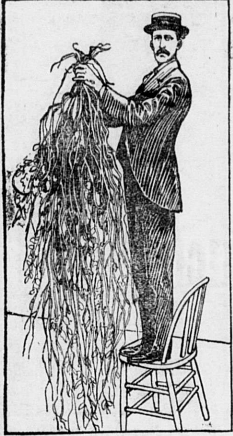
A SINGLE COWPEA PLANT.

The cut shows a single volunteer plant of the Black Renovator cowpea, which grew in the garden of a Pennsylvania farm the past season. The plant completely covered a circle twelve feet in diameter. The stem was three-quarters of an inch in diameter where it entered the ground and was still growing rapidly when taken up Sept. 23. This plant did not come