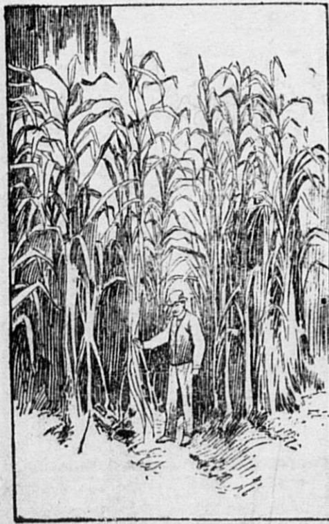
FALL CORN ON LONG ISLAND.

A Long Islander sends The Rural New Yorker a picture of corn in his place 16 feet 6 inches to 18 feet in