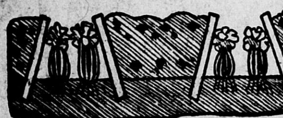
A MULCHING SYSTEM.

In either case the plants are protected from drying winds and heat. In the mulching system we have another advantage. If weather is very dry and hot, we can let a stream of water, if