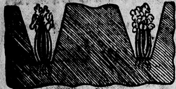
THE OLD TRENCH SYSTEM.

Surface Culture in Double Rows With a Manure Mulch. Apropos of setting celery for fall and winter crops in the south, T. Grenier, a man of mark in the gardening fraternity of the north, meditates