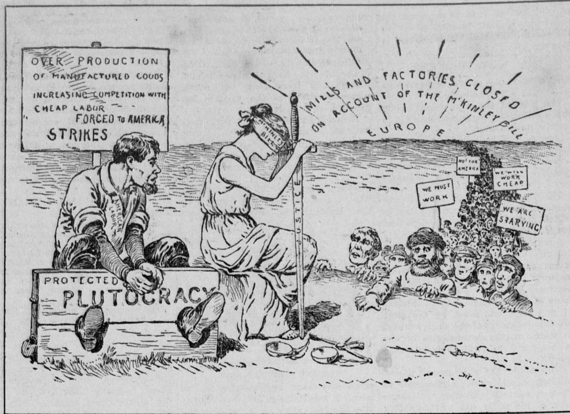
The Effect of the McKinley Bill.