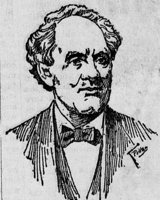
P. T. BARNUM.