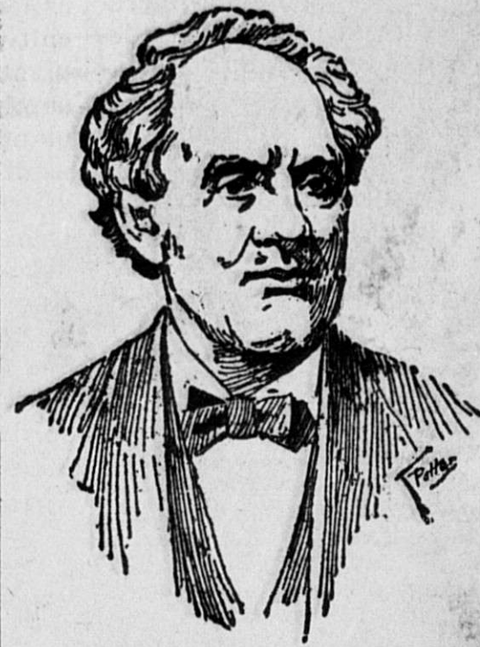
P. T. BARNUM.