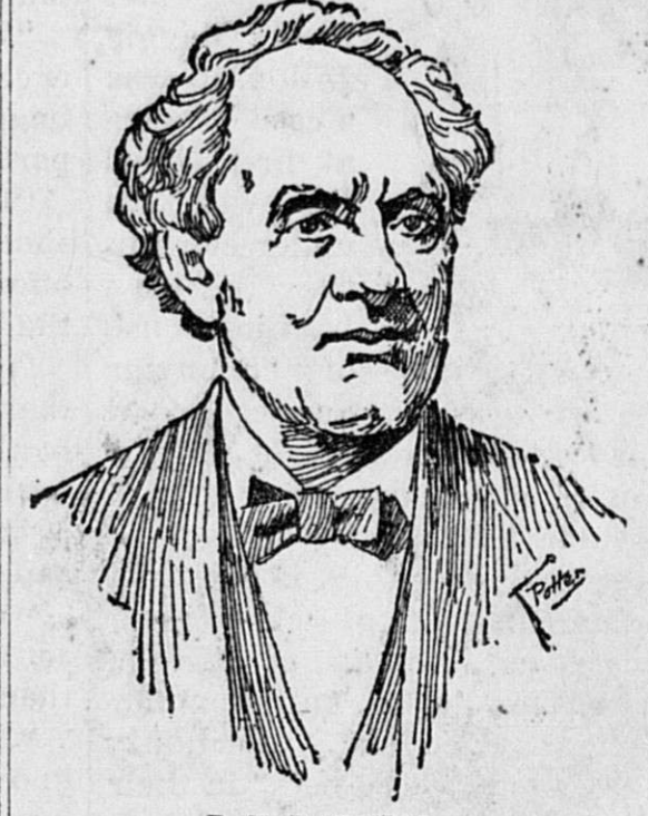
P. T. BARNUM